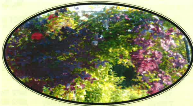
"Let It Bee Garden"

Let us dance for the joy of June... Summer solstice, new life, awakening our senses!