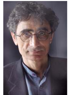
Dr. Gabor Maté

As seen in August 2010 issue Reader’s Digest